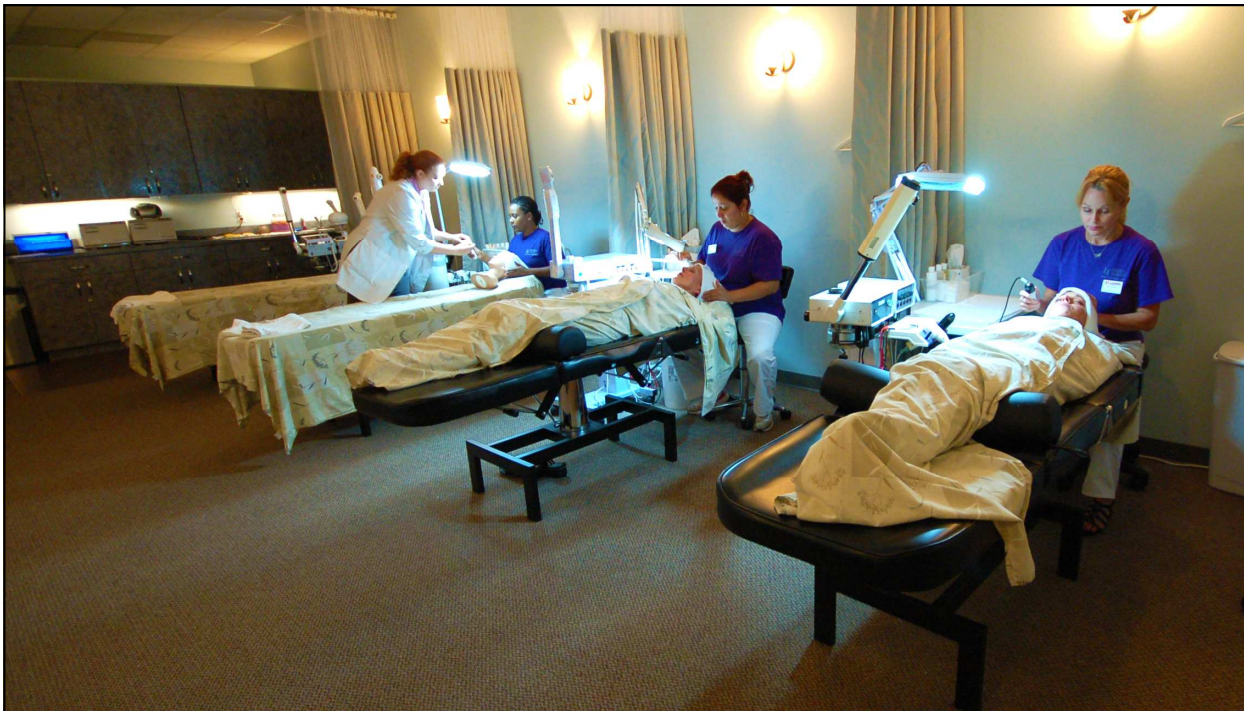
Student Facial Salon