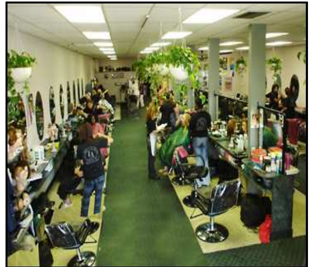
Loraines Academy Spa